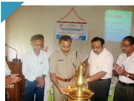
Shri. Sethuraman.K. IPS, Superintendent of Police, Malappuram inaugurates the National Seminar at NSS College, Manjeri.